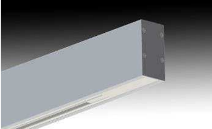
TRACK USED IS LIGHTOLIER 6108NWH, 6101NWH, AND 6149NWH