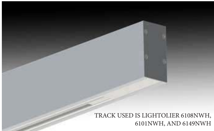
TRACK USED IS LIGHTOLIER 6108NWH, 6101NWH, AND 6149NWH